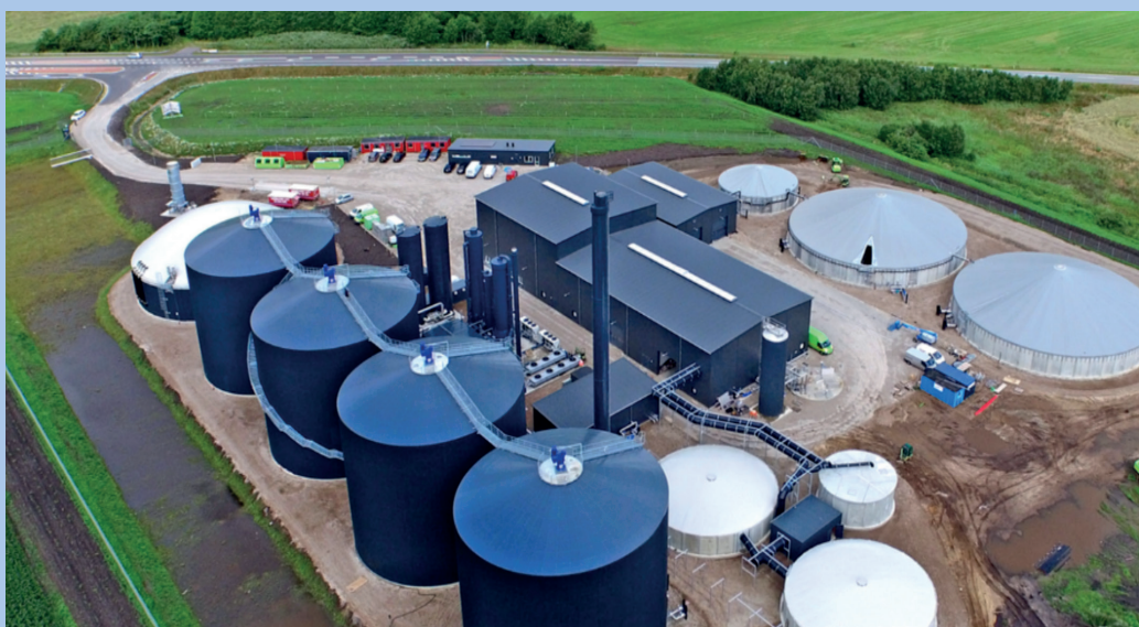
Figure 3: Holsted Biogas Plant, producing 20.7 million m 3 gas / year.

The four large AD plants, built by Nature Energy A/S in recent years (Holsted (Figure 3), Korskro/Esbjerg, Videbæk and Månsson (the largest organic green gas plant in Europe)) have the capacity to convert 1,000,000 tons of digestible wastes and manure into