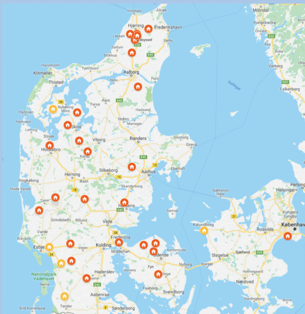
Figure 2: Grid connections for green gas in Denmark (yellow marks indicate connections established in 2017)