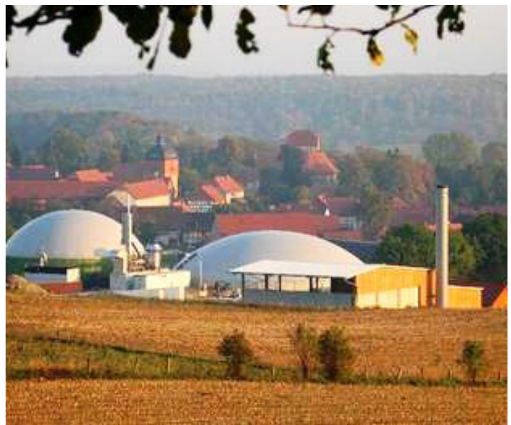
Figure 1: The bioenergy plant in the idyllic village Jühnde