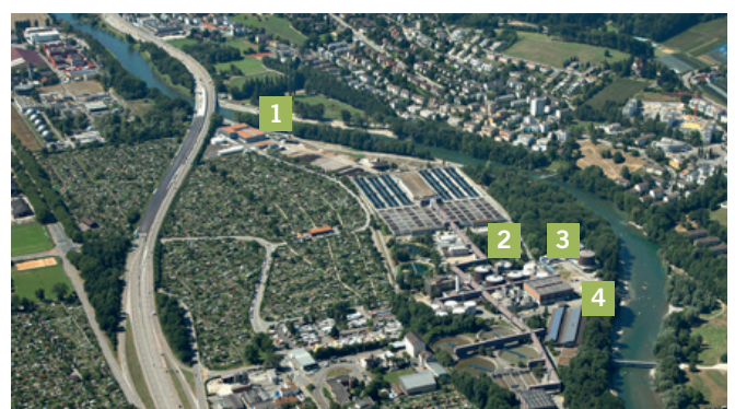
Figure 1: Situation plan