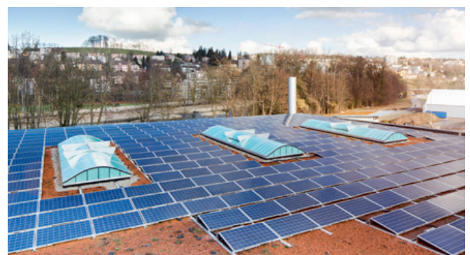
Figure 7: Photovoltaic facility