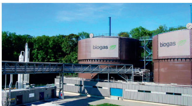
Figure 4: Biogas upgrading plant

To complete the innovative energy concept, Erdgas Zürich AG installed in cooperation with Biogas Zürich AG a photovoltaic facility on top of the storage and composting hall (Figure 7). This allows use of the large space available to produce still more energy. The generated electricity is injected into the grid.