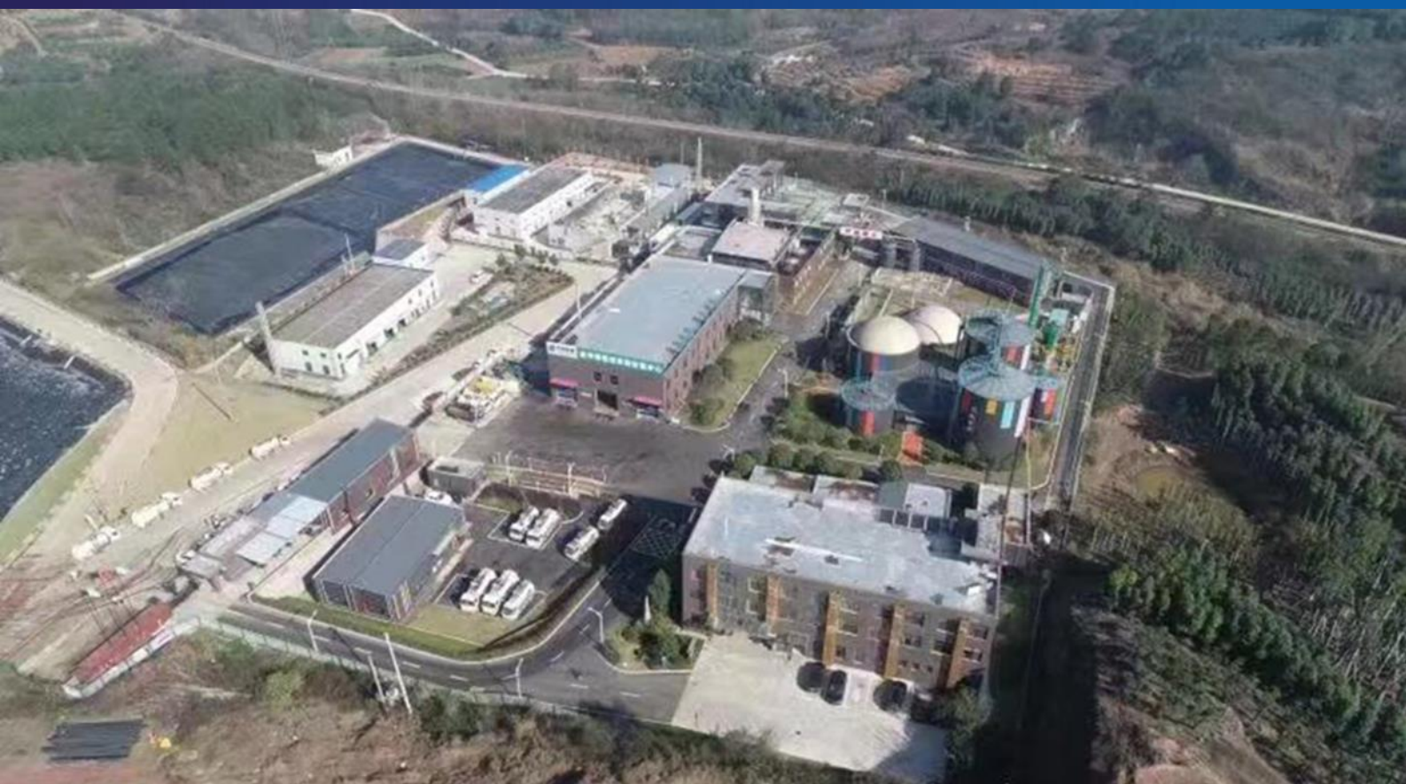
Figure 1. An overview of the Jinhua Kitchen Waste Biogas Plant