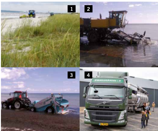
Figure 1-3: Harvesting seaweed along Køge Bay costal line, Figure 4: Tanker for biomass transport