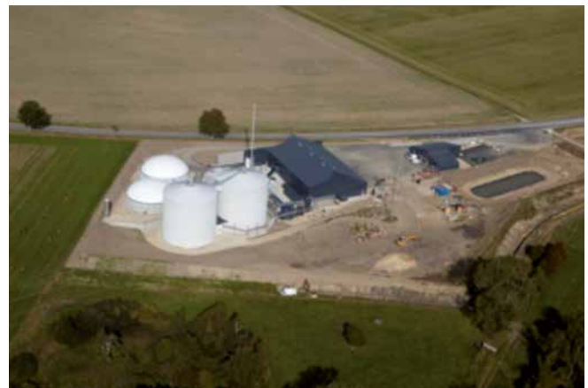
Figure: Solrød Biogas Plant, taken into operation in 2015