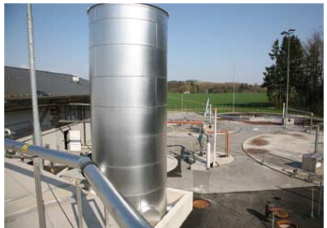
Photo 2: Biogas plant, Fermenter and Desulphurisation-column (in the front)

The digestate storage tank (originally planned as an open