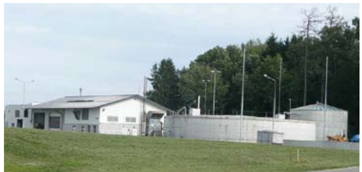
Photo 1: Biogas plant

The combined slaughterhouse/biogas plant is located at St.Martin/Innkreis in the North-West of Austria. This biogas plant is processing all animal by-products which may not be further utilized such as blood, hind gut, stomach content and fat scrubber content. The electricity produced from biogas is fed into the national power grid and the heat is delivered to the slaughtering facility. The specific load profile of the slaughterhouse showed that only during 35% of time the heat produced by the CHP could directly be consumed in the slaughterhouse. Therefore, a hot water storage tank serves as buffer to match the steady heat production with the heat demand of the slaughterhouse. Thus nearly all of the heat produced in the biogas plant is used in the slaughterhouse covering 80% of its energy demand.